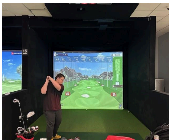
PE 10 CCT Indoor Golf Centre