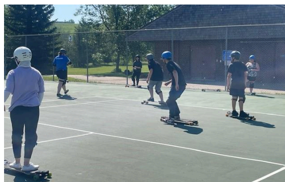
PE 10 Longboarding