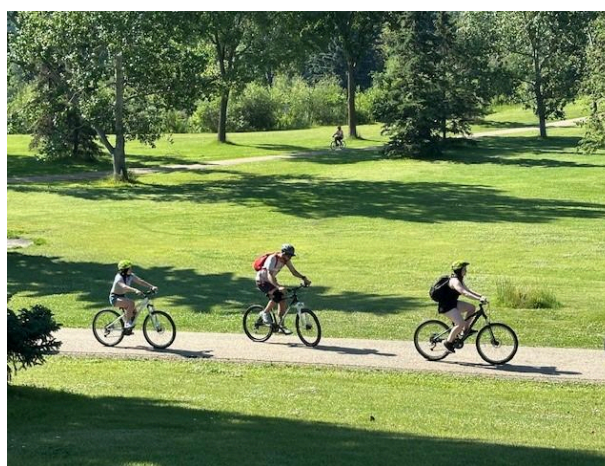
PE 10 Biking - Edmonton River Valley