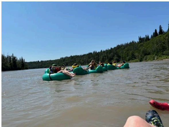
North Saskatchewan River Float