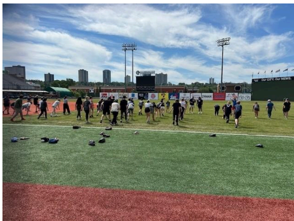
Edmonton Remax Field Slo-Pitch